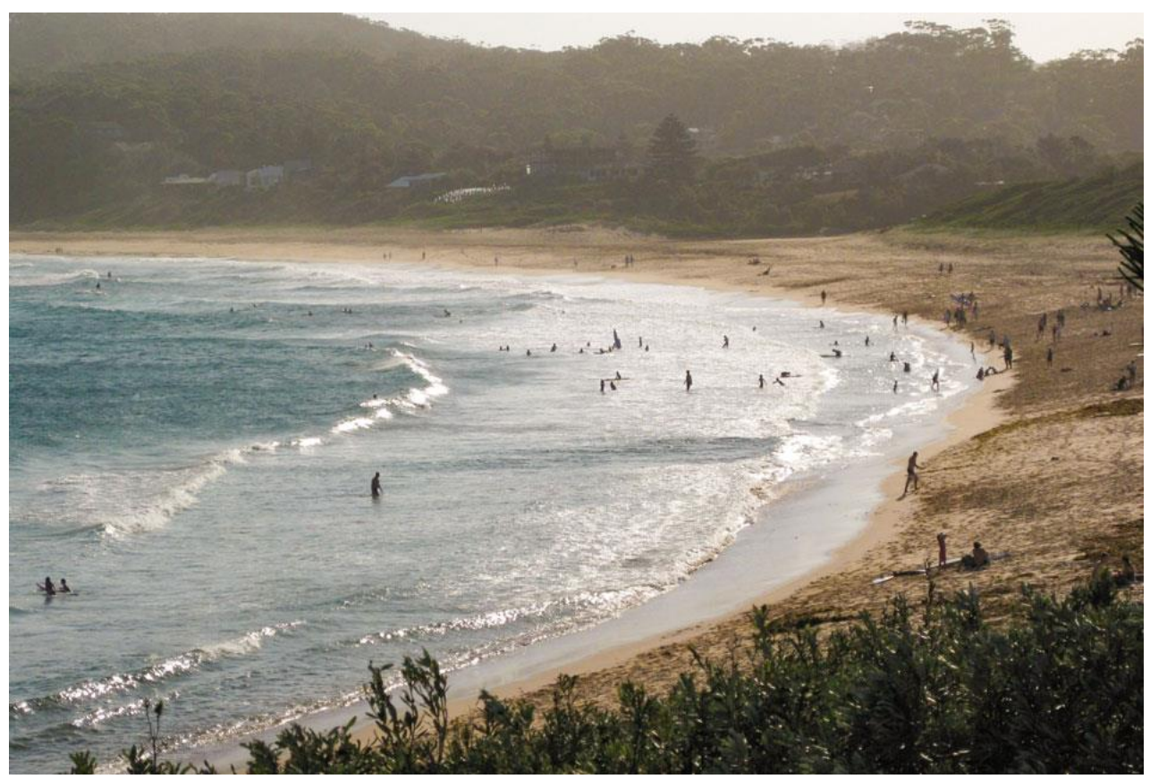
Robertson received $3000 to install a bench seat on Copacabana Beach, which is claimed will "promote a sense of community pride".

Dobell has received $2.7 million in grants. Robertson received $14.6 million in promises including $3000 to install a bench seat on Copacabana Beach, which the grant information claims will "promote a sense of community pride".