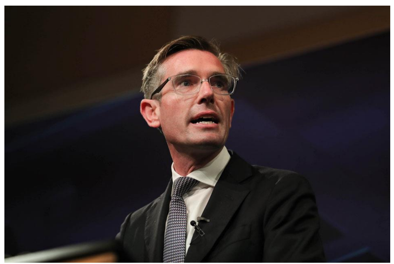
NSW Premier Dominic Perrottet has pledged to examine the way grants are handed out by his state government.

Federally, Labor has promised if it wins government it will ensure faster reporting of when ministers allocate grants against the advice of their departments or in their own electorates.